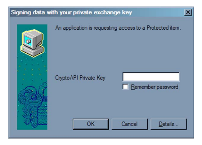
Figure 1 The Microsoft CSP's password-prompt dialog.

We believe PKI is valuable and that secure Web information services are important. We also realize that any deployment will require considerable effort and user education (as we participate in such a deployment here at Dartmouth). Hence, we believe that it is important to ask: Does it work ?