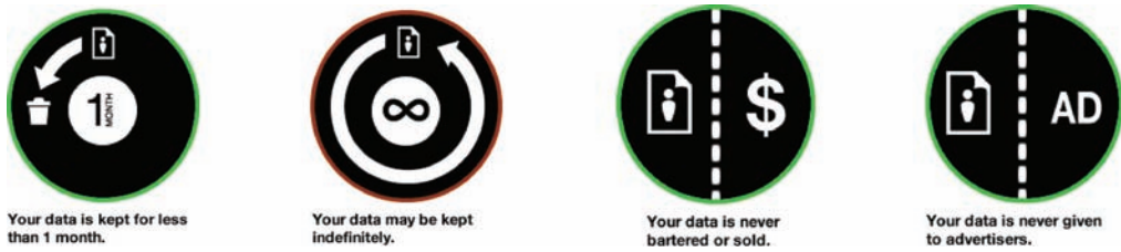
Fig. 2. Sample privacy icons (reproduced with permission by Aza Raskin, http://www.azarask.in/blog/post/privacy-icons/ ).

than if they used a simpler, less sophisticated system. Finally, the design should allow its operators to easily update it to meet changes in regulatory requirements.