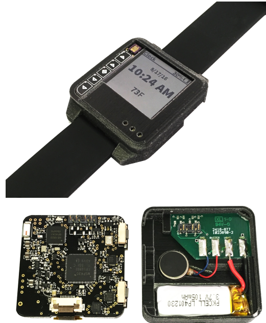
Figure 1: Perspective and interior views of our open-hardware wearable device, part of the open-source Amulet Platform. The platform supports development of energy-efficient, body-area-network sensing applications on multi-application wearable devices.

DOI: http://dx.doi.org/10.1145/2994551.2996527